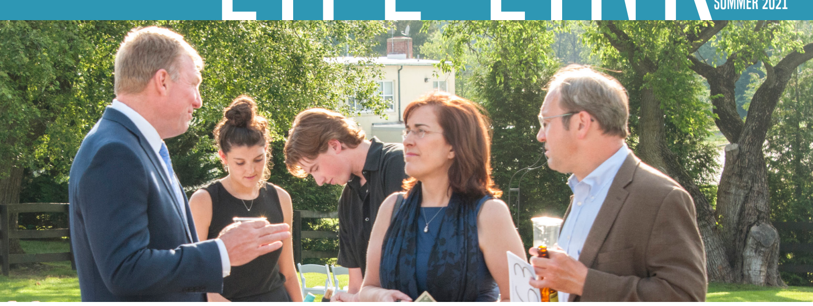
More than 325 supporters gathered on June 18 for our fourth annual gala. See page 3.