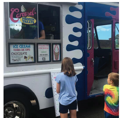
Dozens of friends and supporters came out for our first annual ice cream social on Sept. 11 with support from Carousel Frozen Treats. The event marked the fourth anniversary of our founding on Sept. 9, 2017.