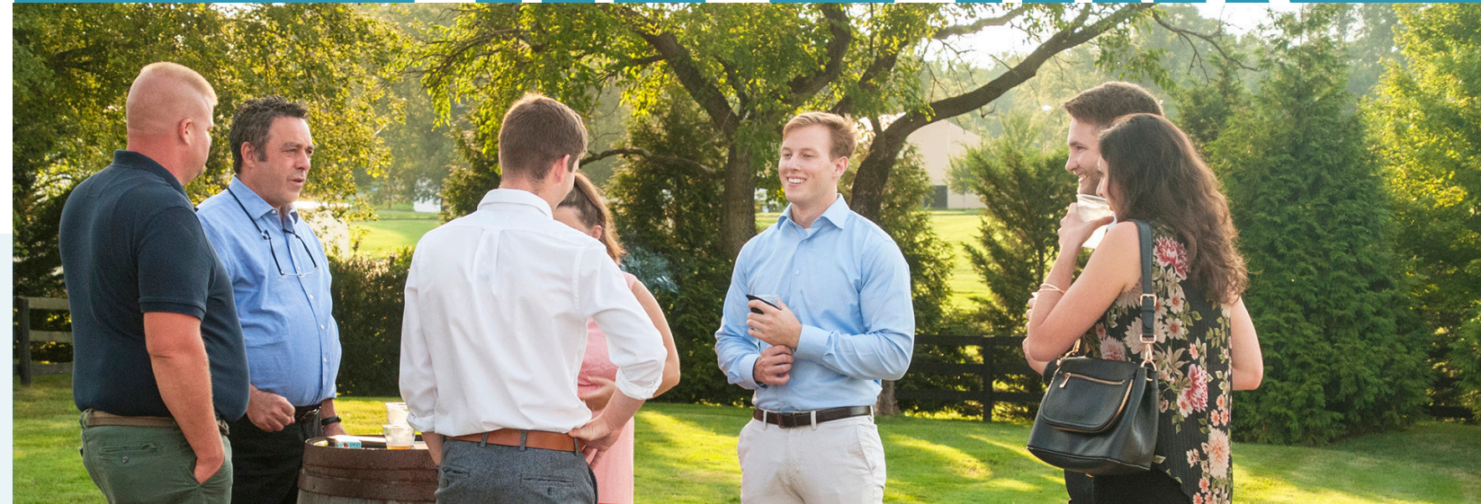
More than 185 supporters attended our Annual Gala on August 7 at The Inn at Vint Hill. Read more on page 3.